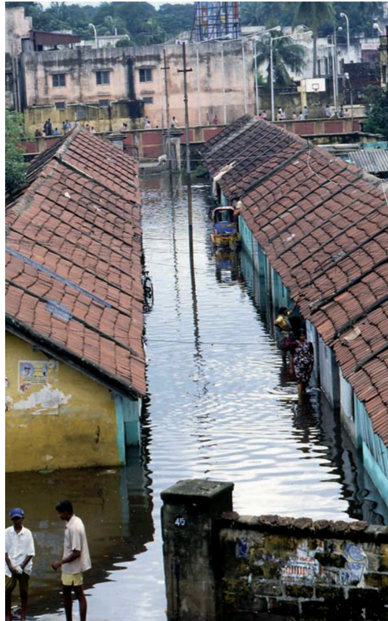
With most of Chennai, India being flat, floods can happen within six minutes from the start of a sustained burst of rain.