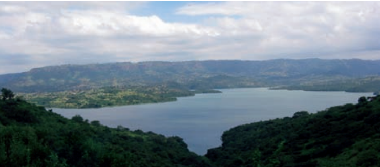
River Basin South Africa.

The approach followed by the teams in the process of developing the different NAPAs is guided by some basic principles, including that the process 'should have a country-driven approach and be a participatory process involving multi-stakeholder consultation, reflecting a true bottom-up approach'. In addition, the process should involve a multidisciplinary group of experts, and undertake comprehensive and integrated assessments and it should