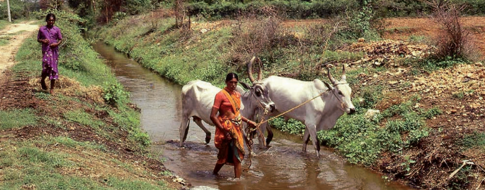
Steadily growing in population, the state of Tamil Nadu in India faces growing shortages of potable water.