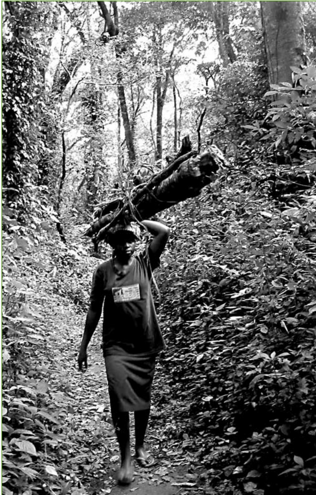
This carbon is mine. Fuelwood collection in Central Africa.